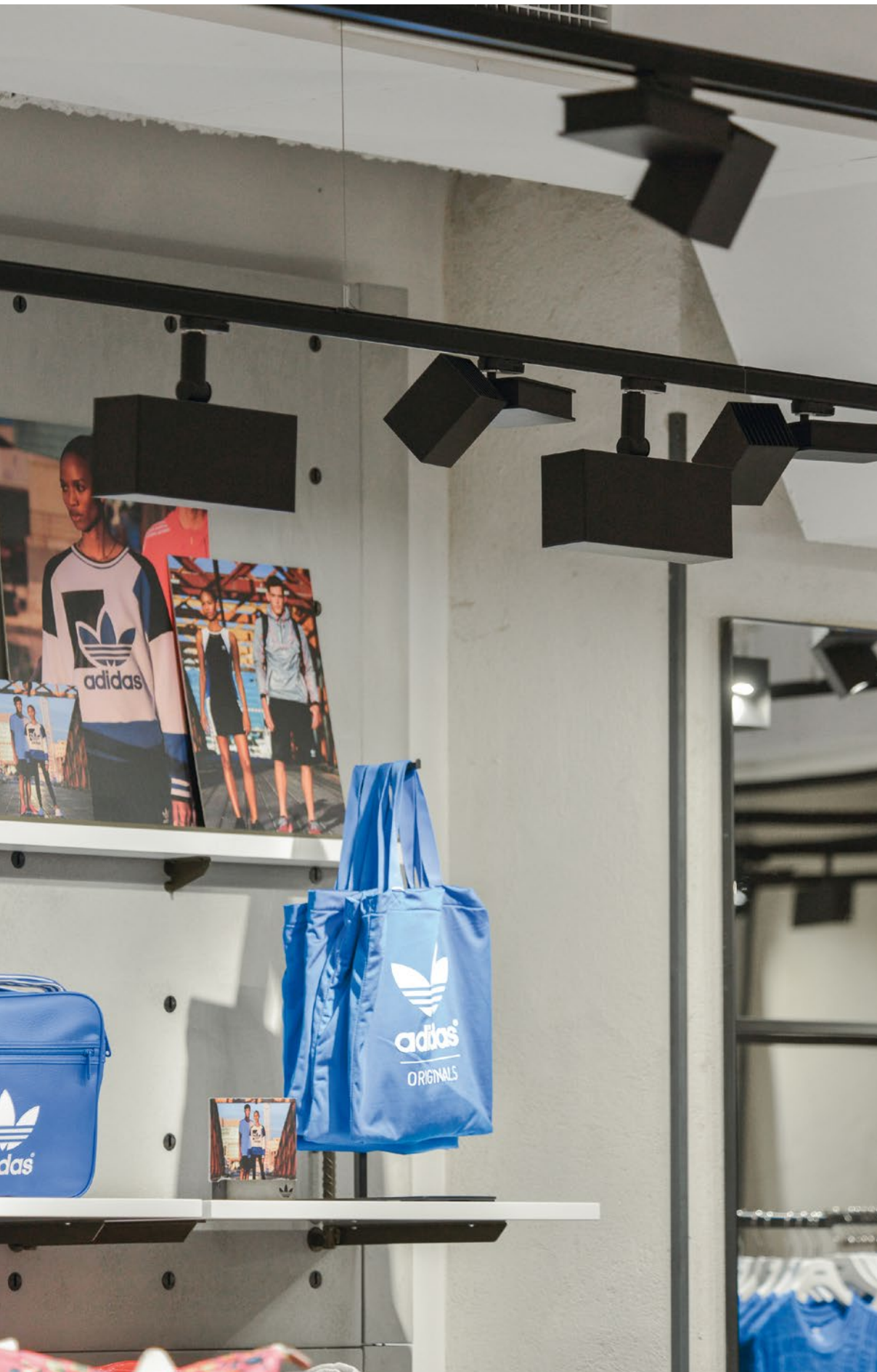
en la imagen_in the picture