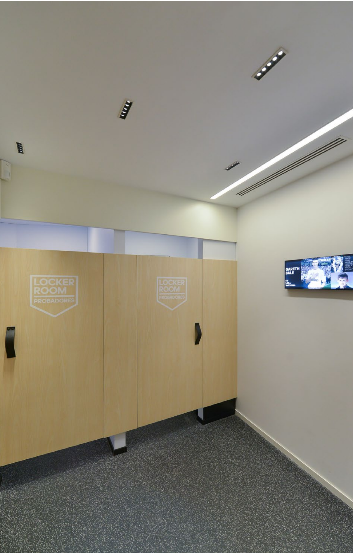
en la imagen_in the picture